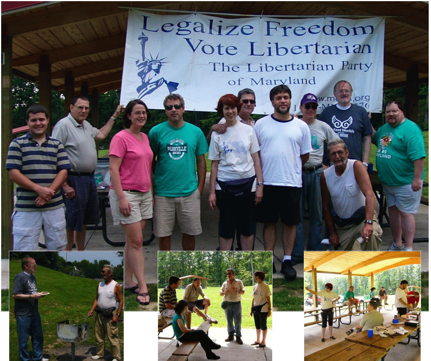
The Baltimore City/County Libertarian Party at an outing at Belmont Park in Parkville.