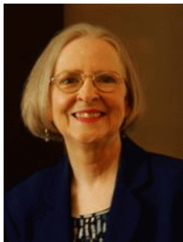
Advocates for Self-Government President