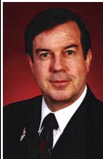
The Impossibility Trap: the Biggest Barrier to Libertarian Party Progress and Success – and how to overcome it